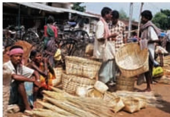
New markets for traditional artisans